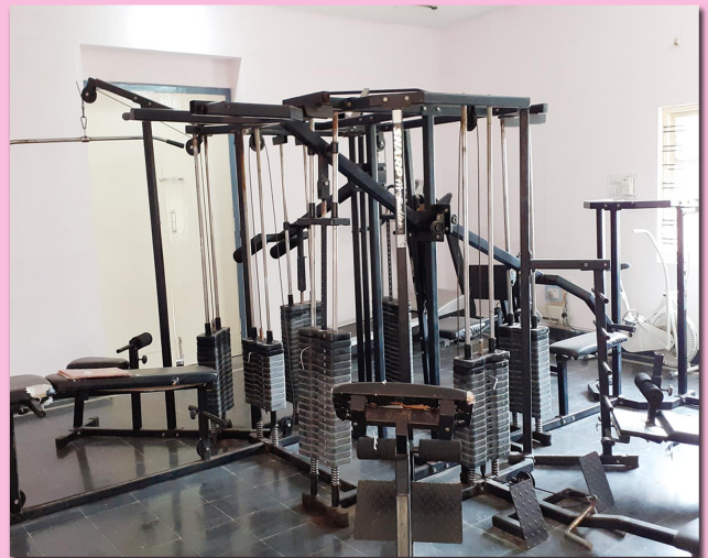
Ladies Hostel Gym