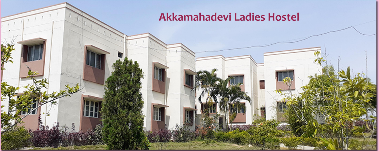
Akkamahadevi Ladies Hostel