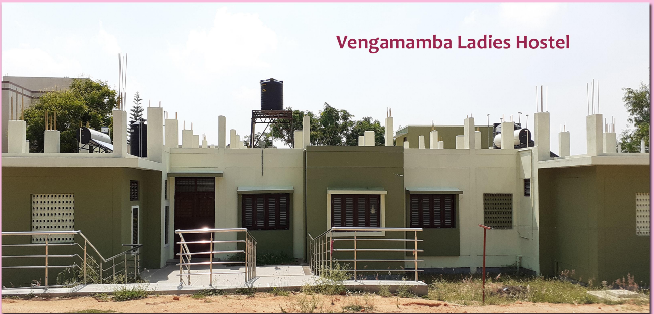
Vengamamba Ladies Hostel