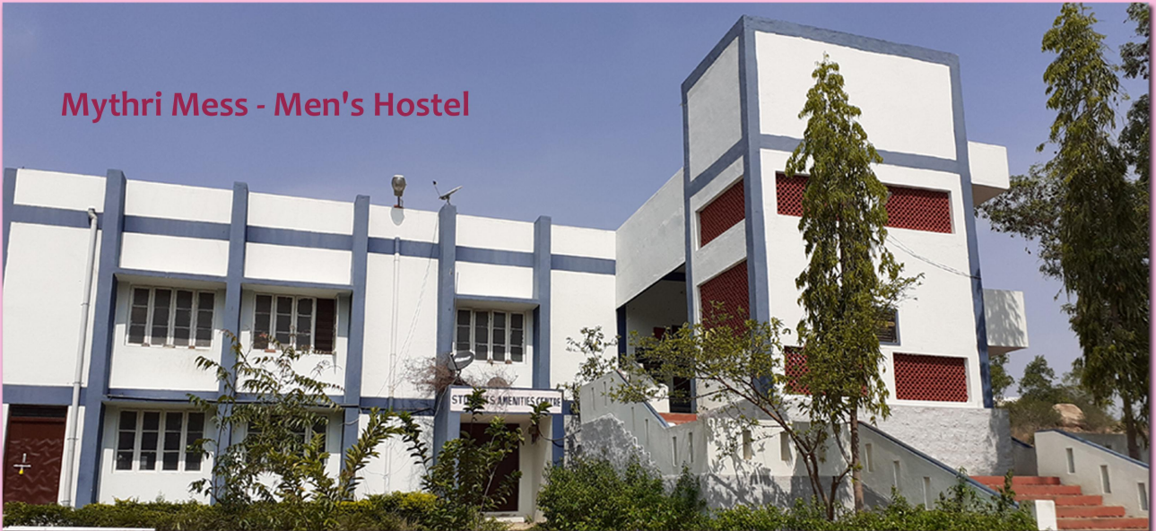
Mythri Mess - Men's Hostel