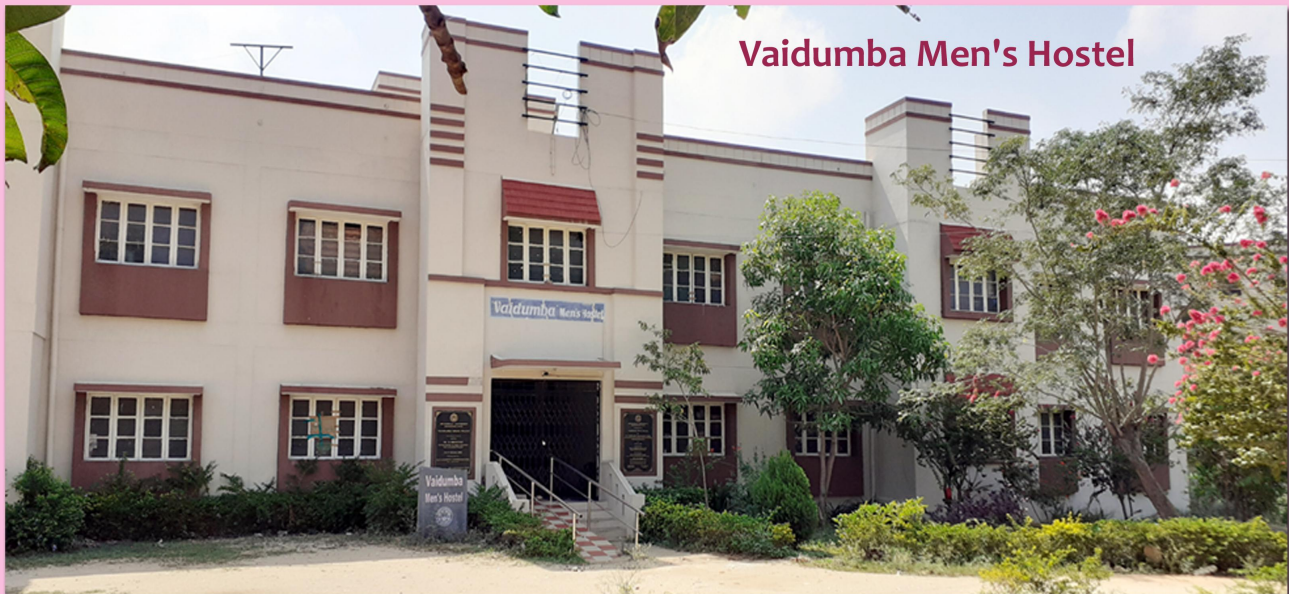
Vaidumba Men's Hostel