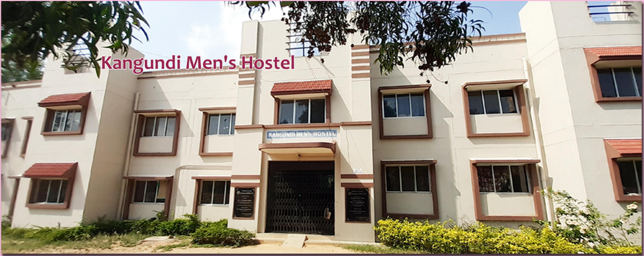
Kangundi Men's Hostel