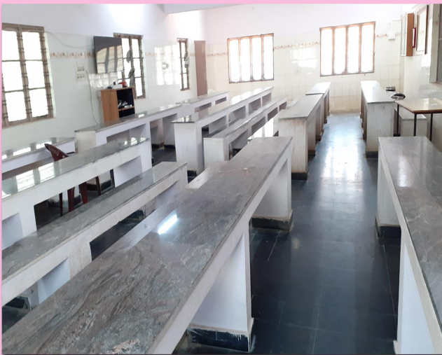
Ladies Hostel - Dining Hall